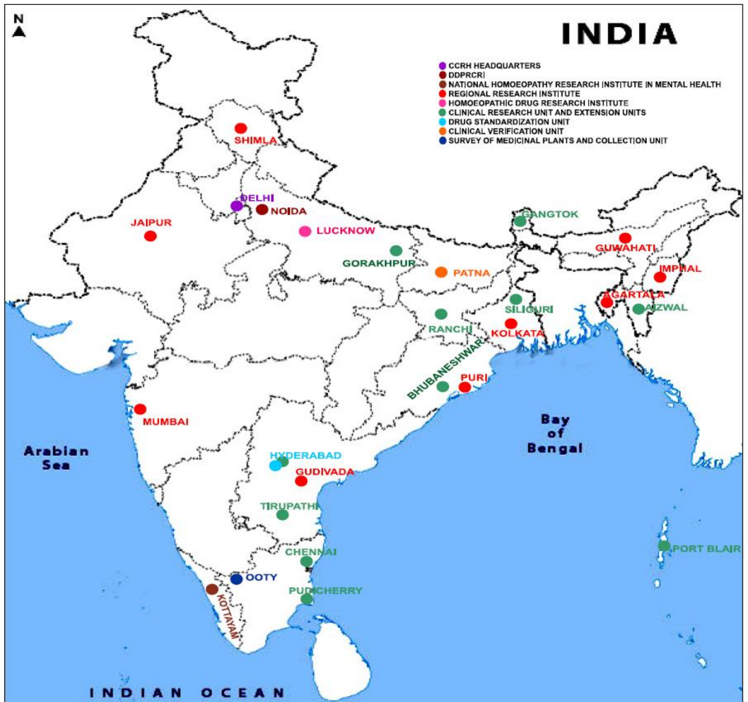
Figure 14: Network of Institutes and Units of CCRH in the country.