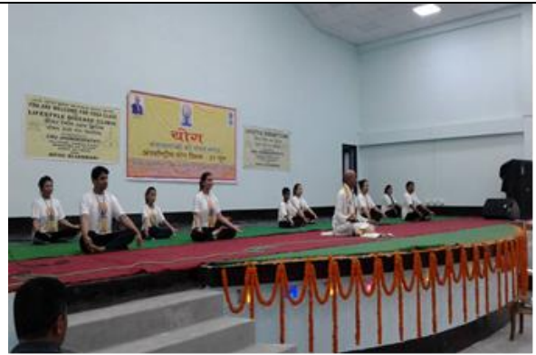
Activates undertaken on International Yoga Day, Darjeeling District, WB