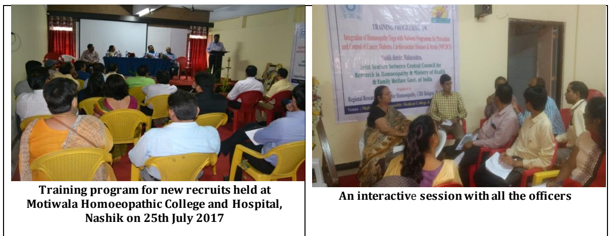
Training program for new recruits held at Motiwala Homoeopathic College and Hospital, Nashik on 25th July 2017