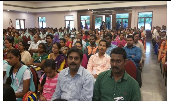
Breast Cancer Awareness program on Dt. 18.10.2015