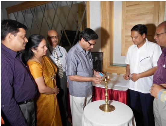
Lighting of Lamp by the dignitaries