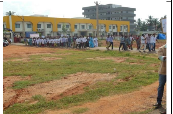
Rally on World Heart day