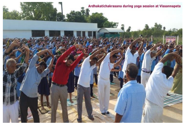
Activates undertaken on International Yoga Day, Krishna District, AP