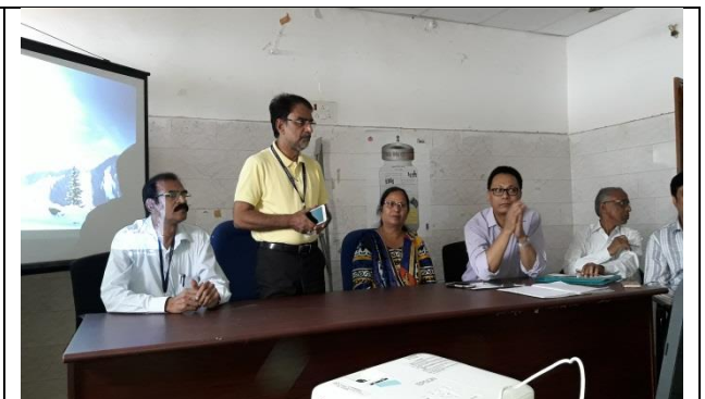
An interactive session with all the officers