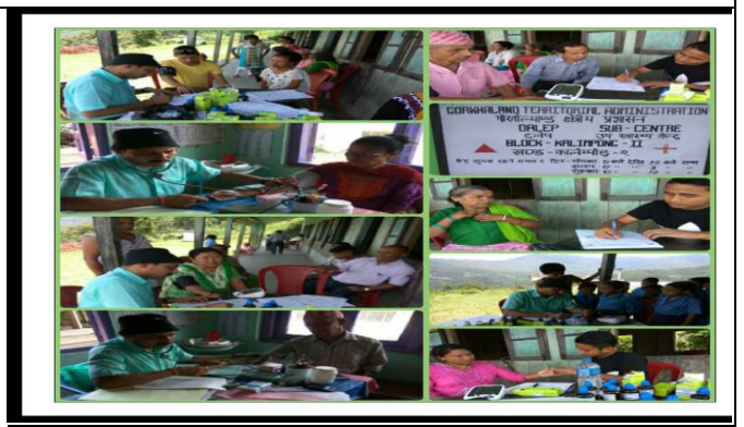
Camps conducted at Darjeeling District (WB)