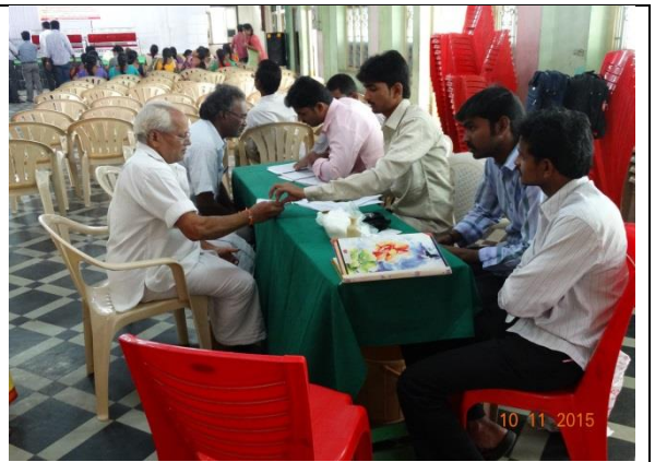
Screening of patients for diabetes